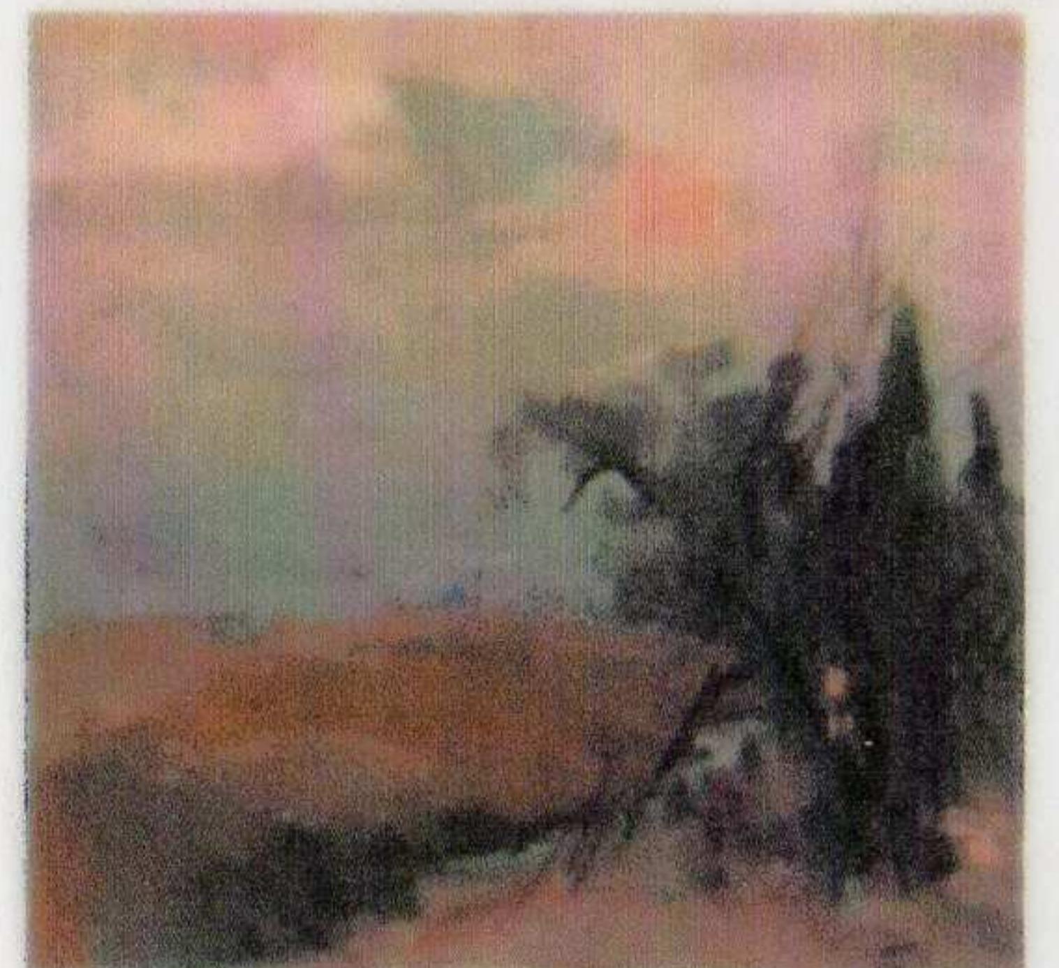
Dawn in Tuscany Oil on panel 30 x 30cms