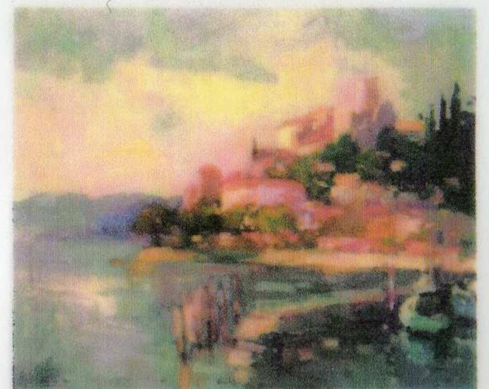
At Lago Trasimeno, Tuscany Oil on canvas 50 x 60cms

To view all the paintings exhibited go to