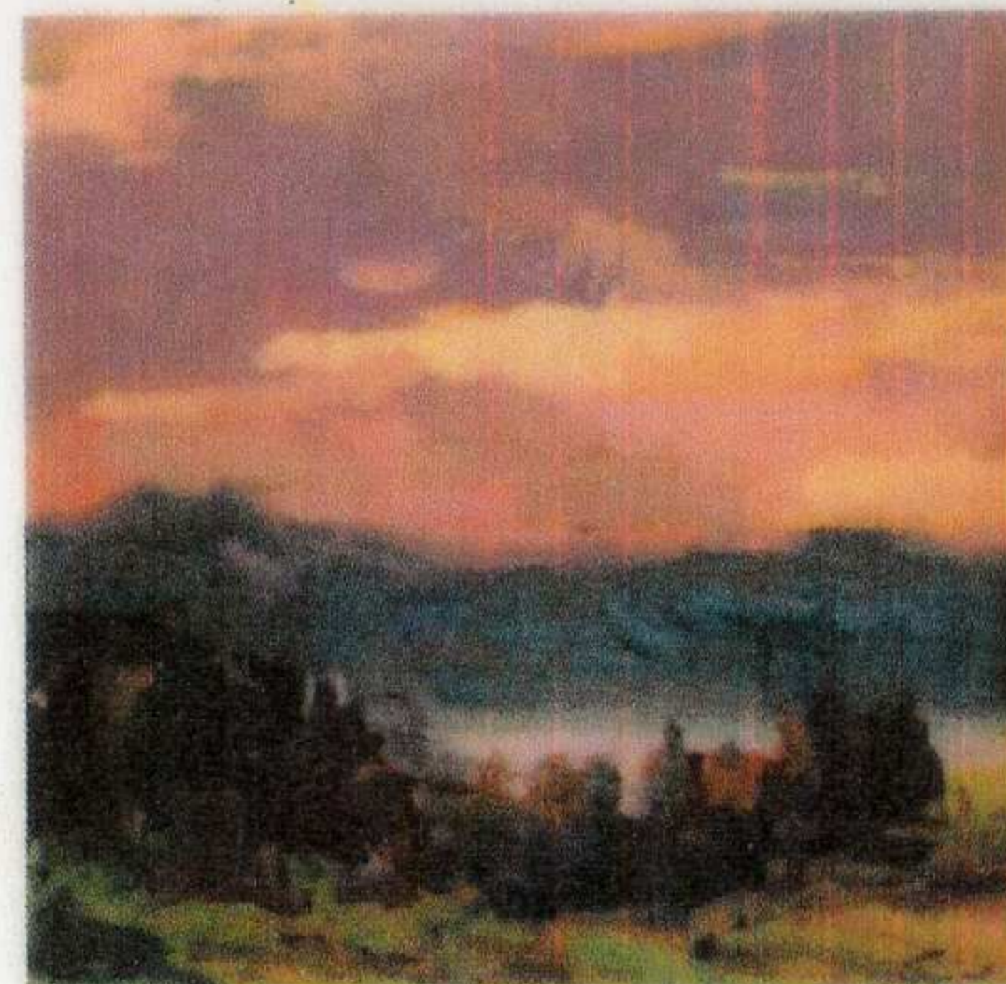
Sunburst Oil on panel 30 x 30cms www.bebbfineart.co.uk

Printed by Reprodex Printers Ltd., Hereford