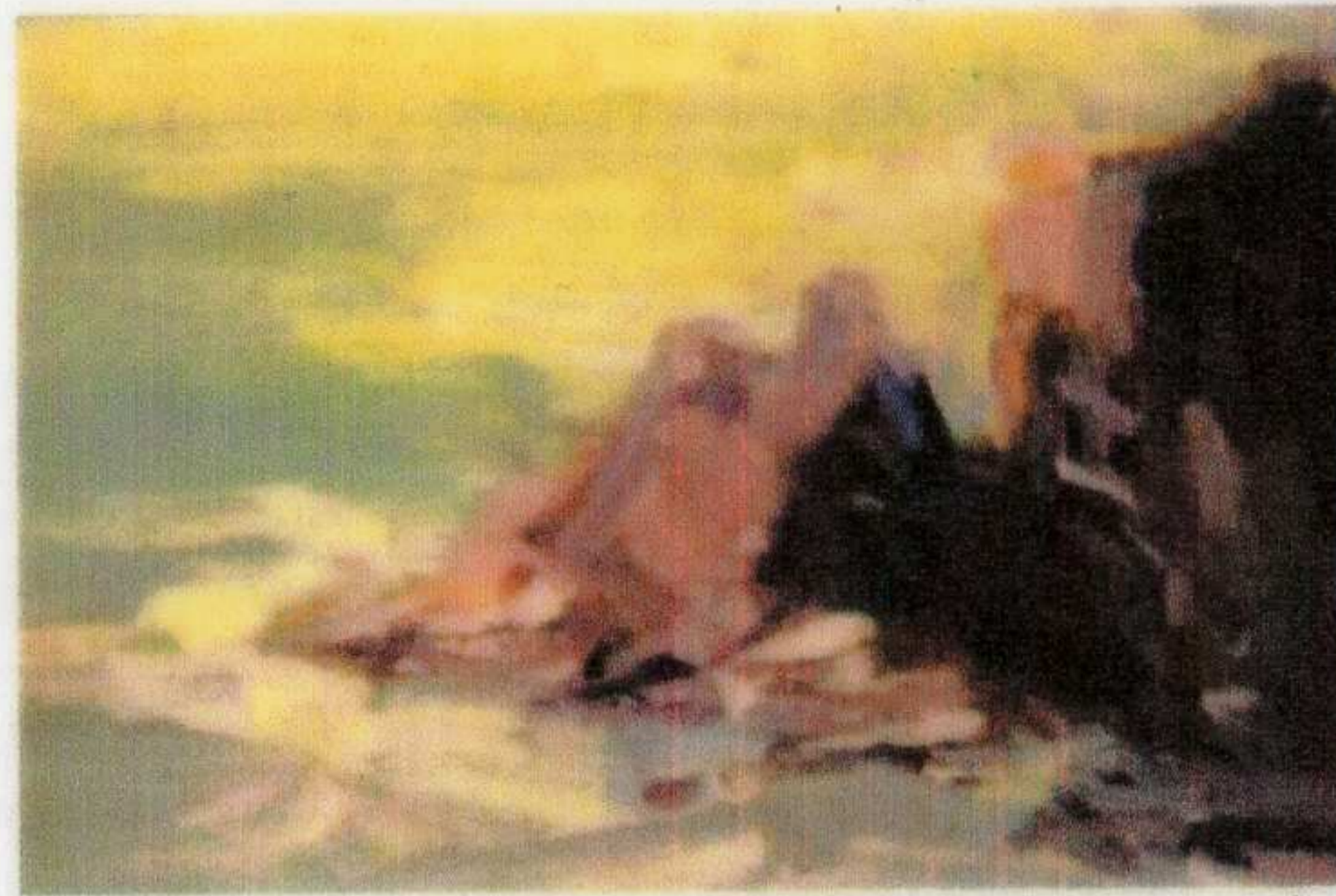
Coast in Italy Oil on panel 23 x 33cms

To view all the paintings exhibited go to www.bebbfineart.co.uk