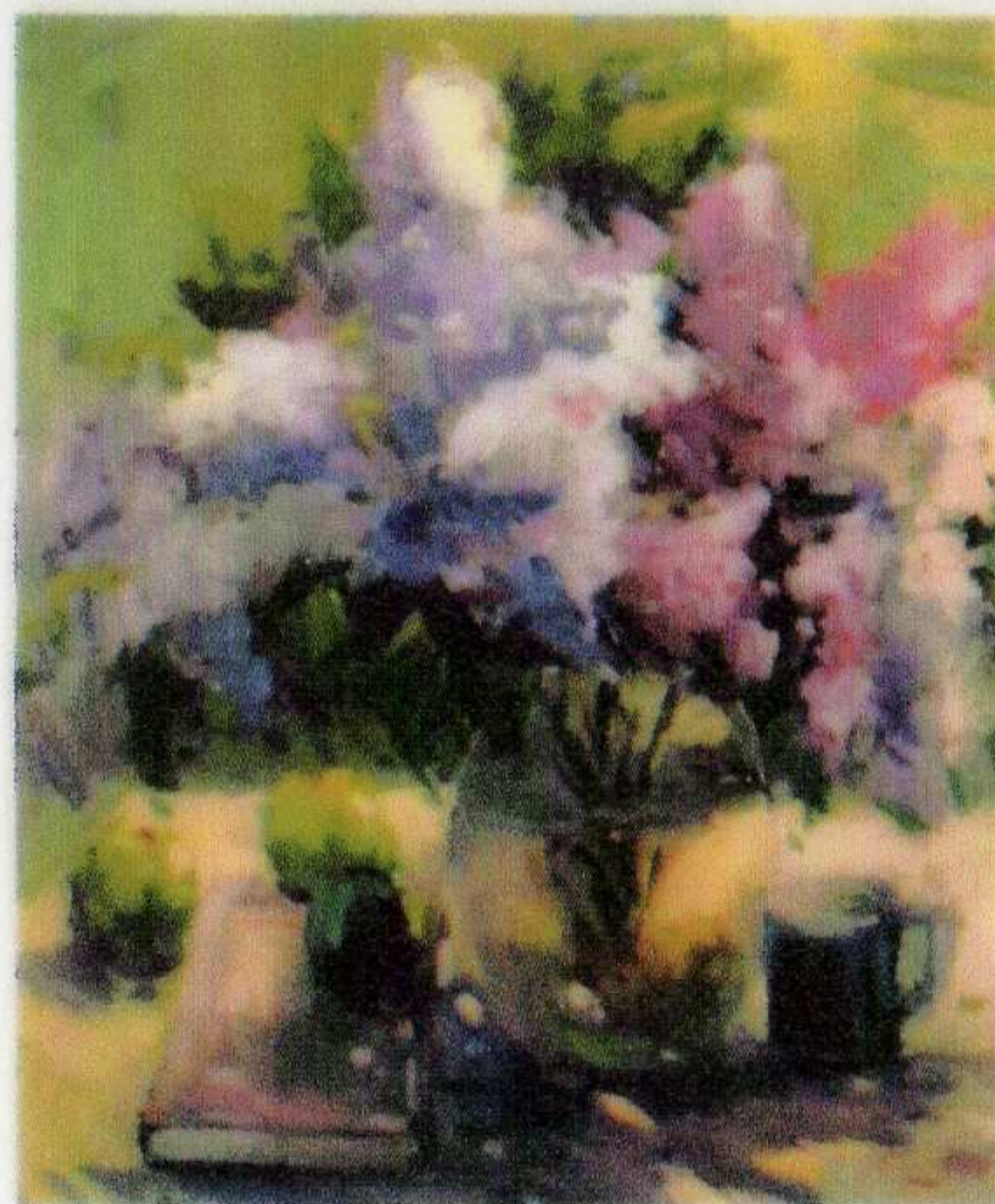
Red and Blue Lilacs Oil on canvas 80 x 70cms