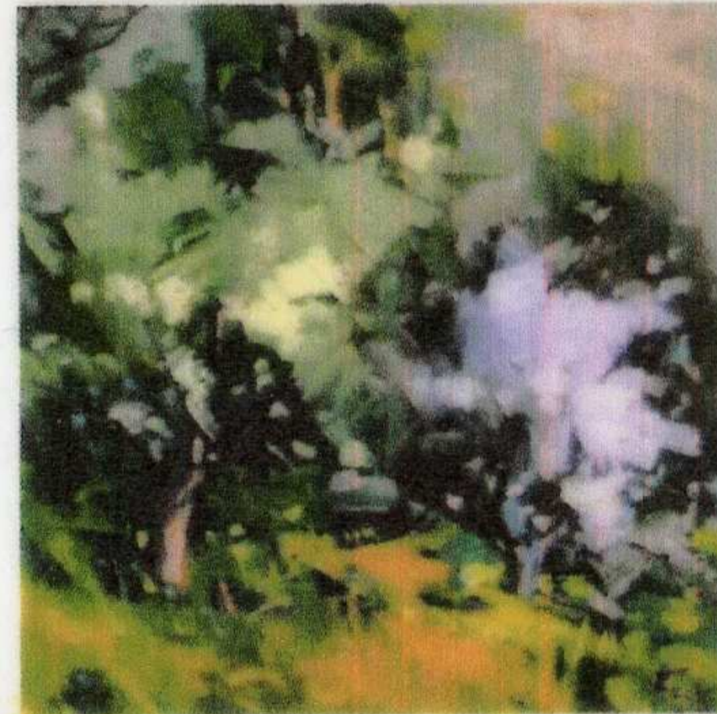
Apple Trees Oil on panel 30 x 30cms