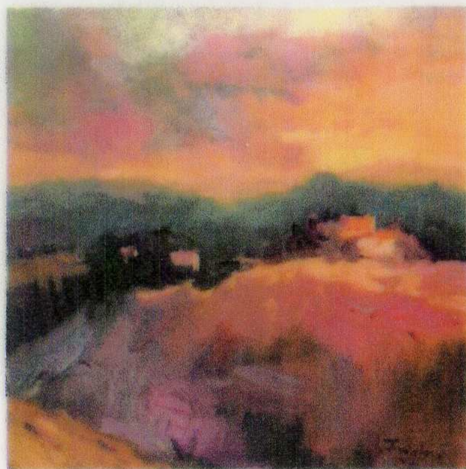
Evening in Tuscany Oil on canvas 60 x 60cms