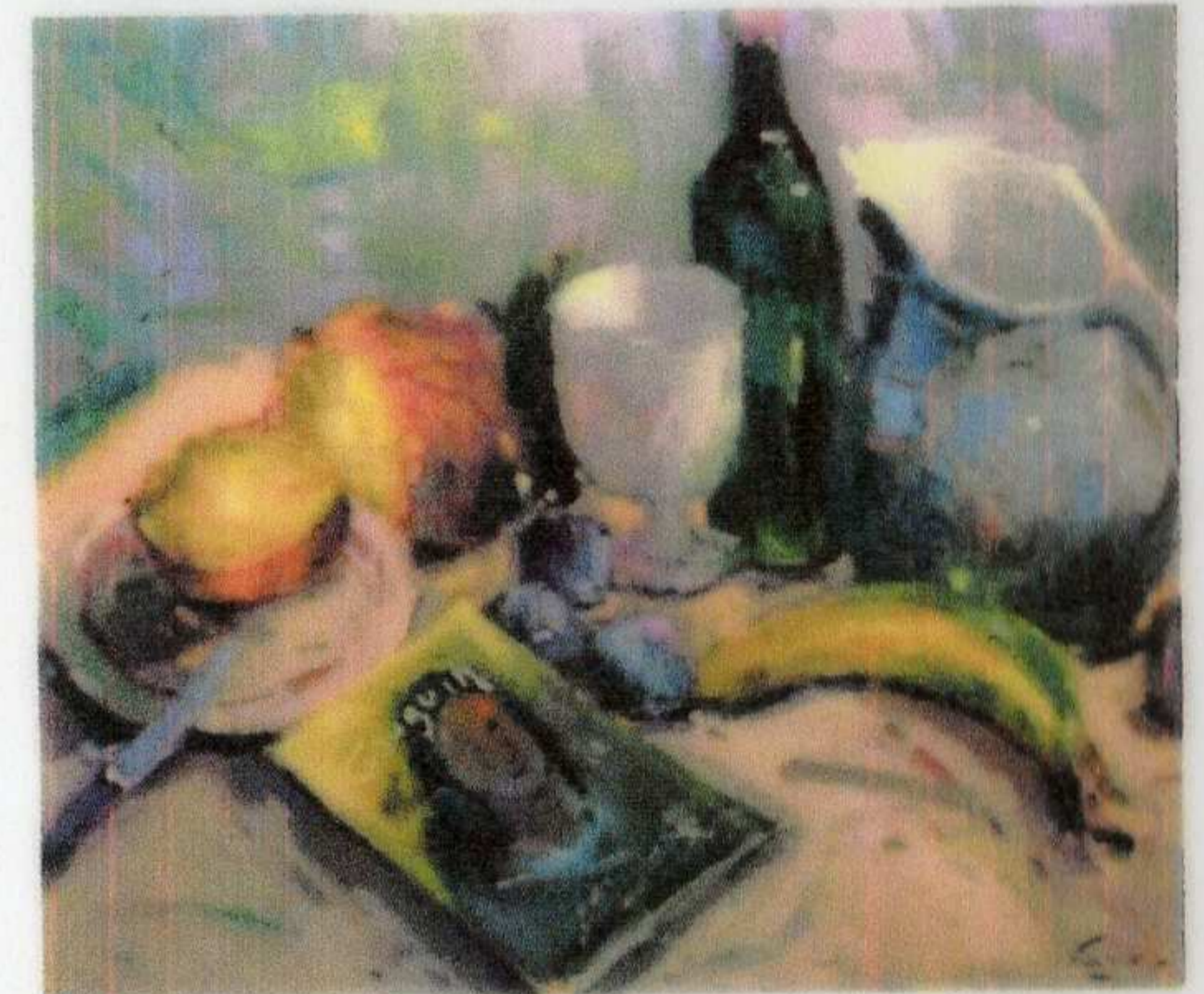
Gauguin's Fruits Oil on canvas 70 x 80cm

1 CHURCH STREET, LUDLOW SHROPSHIRE SY8 1AP TEL: 01584 879612