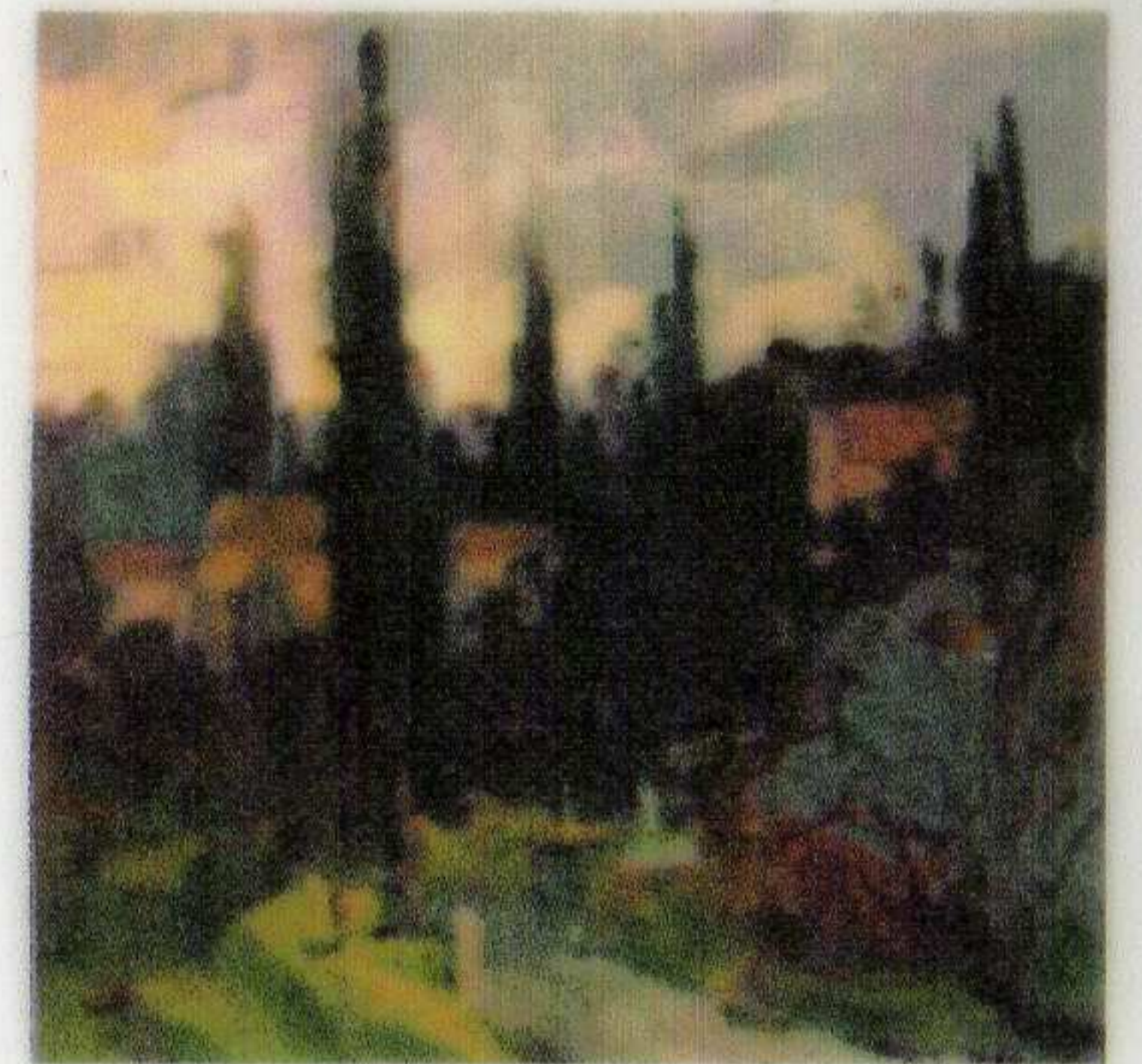
Landscape near Liena Oil on panel 30 x 30cms