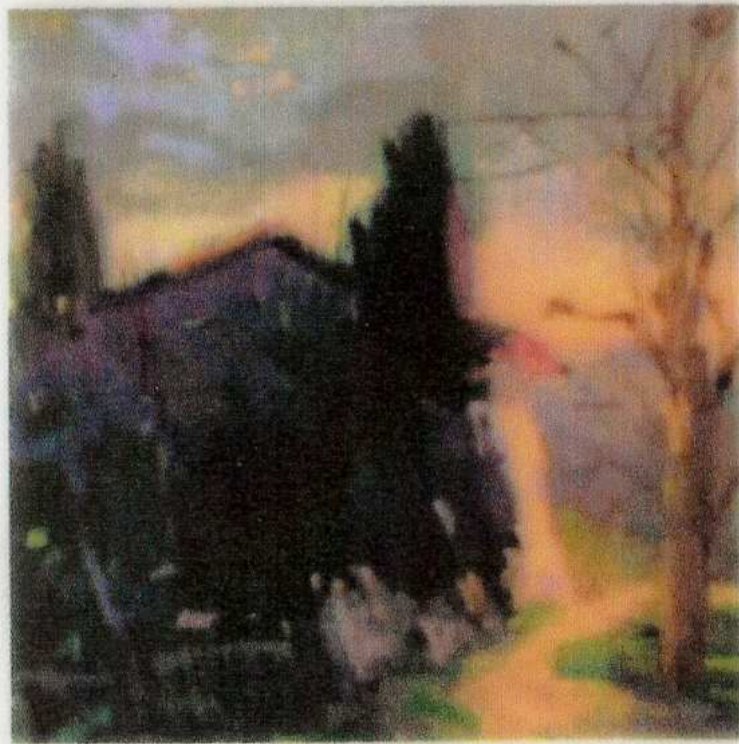
Tuscany Evening Oil on panel 30 x 30cms