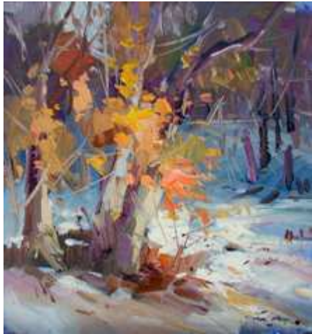
Oil #2 Guido Frick