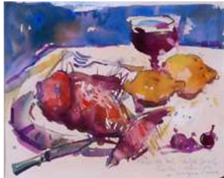
Watercolor #1 Guido Frick