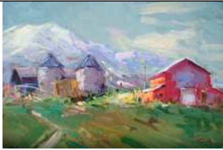
Oil #1 Guido Frick