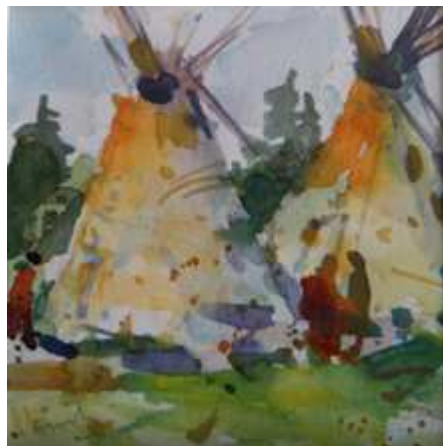
Watercolor #2 Guido Frick