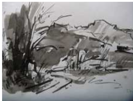
Drawing Ink #3 Guido Frick