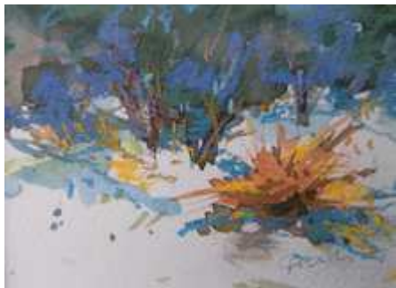
Pastel mixed media #1 Guido Frick