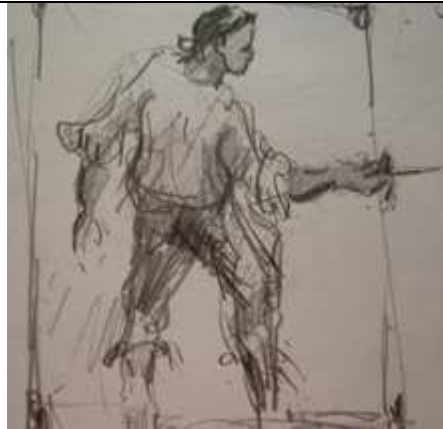
Drawing #1 Guido Frick