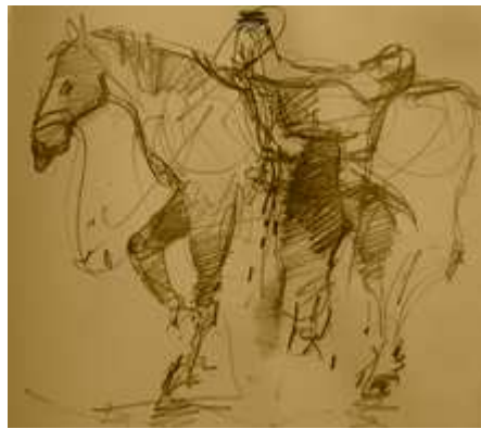
Drawing #2 Guido Frick