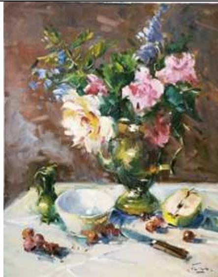
Oil #4 Guido Frick