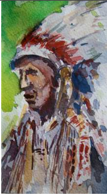
Watercolor #3 Guido Frick